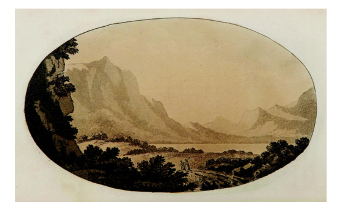
Fig. 3 William Gilpin "An illustration of that wild kind of country...as we entered Cumberland," from Observations, relative chiefly to picturesque beauty .

detail. At the spot Gilpin bound this print into the first volume of Observations , his text urged prospective artists to consider the importance of choosing the correct time of day to make a landscape sketch of mountains: