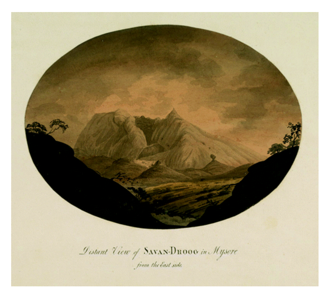
Fig. 2 Colin Mackenzie Distant View of Savan-Droog in Mysore from the East Side. ©British Library Board, London, Shelfmark WD573

With no discernible reference to violence in the landscape, one less familiar with the distinctive silhouette of Savandurga might take the scene for a hilly region in Britain. A comparable image (Fig. 3) may be found in Observations, relative chiefly to picturesque beauty of 1786 by the Reverend William Gilpin , a singularly popular writer about the picturesque in England. Gilpin , who did not shy away from sites of ruined forts or otherwise difficult to access hilltop places in Britain, described this view as 'An illustration of that kind of wild country, of which we saw several instances, as we entered Cumberland.' <sup>5</sup> Gilpin 's aquatint and Mackenzie 's drawing reveal the visual priorities shared by both artists: inclusion of a variety of shapes on land and in the sky, a recession of carefully framed spatial planes, and reliance upon a Claude glass to assist in the discernment of light and dark values as well as the reduction of local