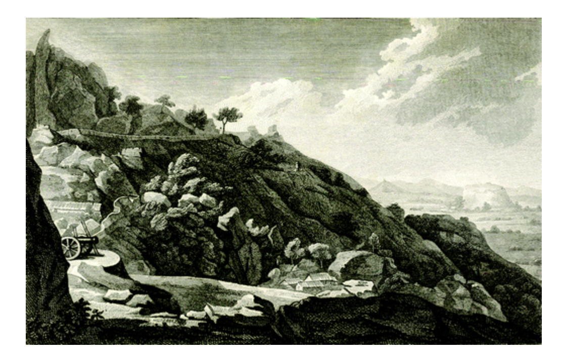
Fig. 4 William Byrne after Robert Home View of Shevagurry from the top of Ramgaree. ©British Library Board, London, Shelfmark W2567(19)

As if to justify his decision to include an explicit reference to weaponry, Home noted that the 'sterile soil' at the site was rich in iron, 'and applied to that worst of purposes, the fabrication of implements of war'. The terrain he described as 'wild and savage... abounding with barren rocks, and extensive thickets, the abode of tigers and other beasts of prey'. Of the presence of British soldiers, Home acknowledged that on 22 December 1791, troops 'attacked the lower fort and pettah,' after which the fort was surrendered, adding that 'it was found to be well provided with guns, provisions, and stores' and had recently been strengthened. <sup>9</sup> But the artist eliminated soldiers from the scene, and even the cannon is marginalized to the extent that it is only partially represented, a diminutive object in a landscape where rocks and clouds play more dynamic (visual) roles. As with Mackenzie 's drawing, it is a severe, uneven terrain that lends an idea of danger to Home 's composition, more so than accoutrements of battle. Lest it is assumed that the printmaker, Byrne, reduced the impact of the heavy gun in the landscape, comparison with the original drawing confirms that Home